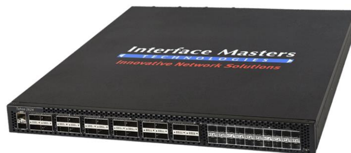
Tahoe 2624 (ISO View)