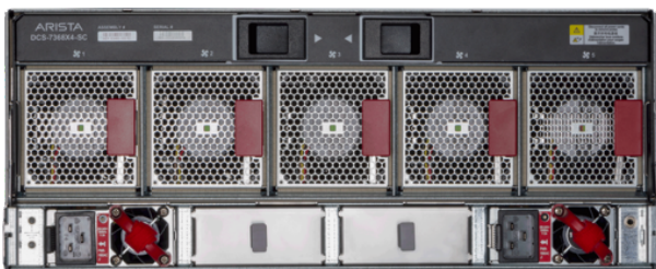
System Rear (Front to Rear Airflow)