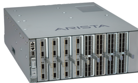
Arista 7358X4: 128 ports of 100G or 32 ports of 400G

All elements of the 7358X4 are field replaceable, and optimized for simple maintenance, a broad range of network interfaces with a choice of industry standard interfaces allowing for easy transitions to the latest 100G/400G networks. Combined with Arista EOS the 7358X4 series deliver advanced features for high performance enterprise data centers, HPC and machine learning clusters.