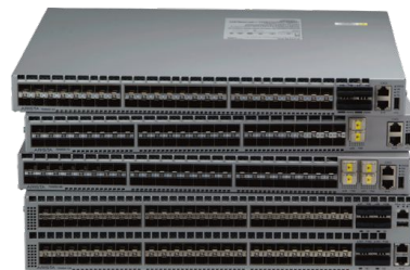
Arista 7050SX Series of 1/10GbE and 10/40GbE Switches Top to bottom: 7050SX-64, 7050SX-72, 7050SX-96, 7050SX-128

Combined with Arista EOS the 7050X Series delivers advanced features for big data, cloud, virtualized and traditional designs.