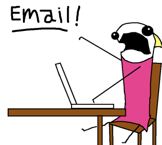
A better approach 2