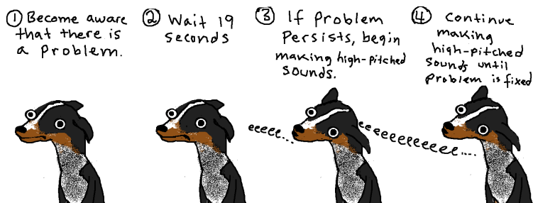
The wrong approach 1

There is a (non-commercial) note taker program affiliated with the DRC. The DRC hires note takers for eligible students with disabilities who need notes for a specific class. See the DRC website for more information.