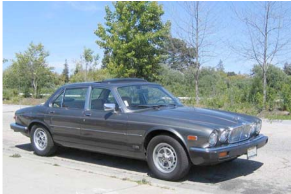
Jaguar XJ6 1986