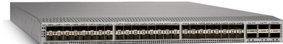
Figure 1. Cisco Nexus 34180YC switch

The Cisco Nexus 34180YC platform runs the industry-leading Cisco ® NX-OS network software operating system, which helps ensure continuous availability and sets the standard for mission-critical data center environments. The platform is designed for programmable fabric, which offers flexibility, mobility, and scalability for service providers and infrastructure-as-a-service (IaaS) and cloud providers; and for programmable networks, which automate configuration and management for customers who want to take advantage of the DevOps operating model and tool sets. It is well suited for data centers that require cost-effective, power-efficient, line-rate Layer 2 and 3 top-of-rack (ToR) switches. These switches also support forward and reverse airflow (port-side exhaust and port-side intake) schemes with AC and DC power inputs.