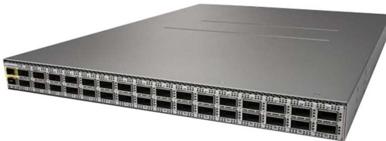
Figure 1. Cisco Nexus 3432D-S Switch

The Cisco Nexus 3432D-S (Figure 1) is a Quad Small Form-Factor Pluggable – Double Density (QSFP-DD) switch with 32 ports that are backward-compatible with QSFP+, QSFP28, and QSFP56. Each QSFP-DD port can operate at 400, 100, 50, 40, and 25 Gbps.