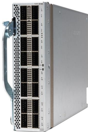
Figure 2. Cisco Nexus NXM-X16C, 16 ports of 100G

The 100G LEMs are 16 ports of QSFP28 supporting 100, 50, 40, 25, and 10G speeds.