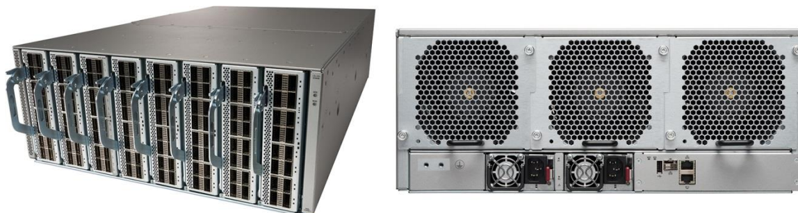
Figure 1. Cisco Nexus 3408-S

The Cisco Nexus 3408-S (Figure 1) is a 4-Rack-Unit (RU), 8-slot chassis with the flexibility of 100G or 400G Line-Card Expansion Modules (LEMs) offering 128 ports of 100G or 32 ports of 400G. The Cisco Nexus 3408-S is the industry's highest port radix in a compact and energy-efficient form factor. The Cisco Nexus 3408-S supports HVAC/DC power inputs with forward airflow direction.