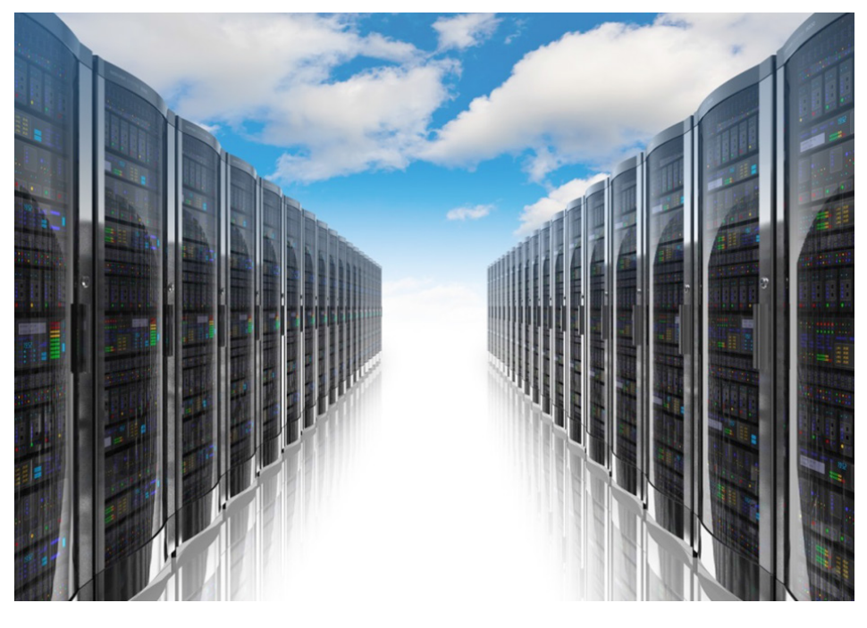
Figure 1: Cloud-scale Datacenters

In traditional network monitoring, an application polls the host CPU to gather aggregated telemetry every few seconds or minutes which doesn't scale well in next generation networks. In-band telemetry enables packetlevel telemetry by having key details related to packet processing added to the dataplane packets without consuming any host CPU resources.