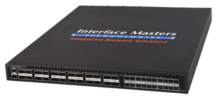
Tahoe 2624 (ISO View)