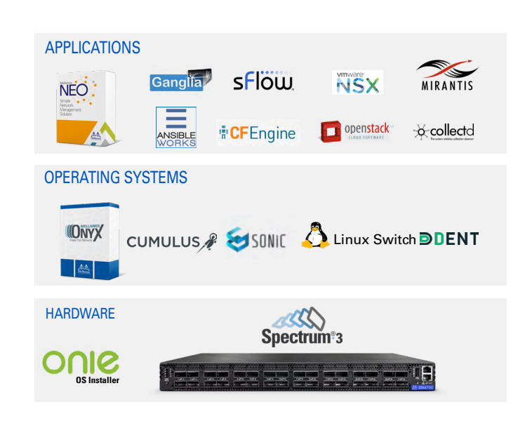
Figure 1. Open Ethernet Operating System and Hardware

With a range of system form factors, and a rich software ecosystem, SN4000 series allows you to pick and choose the right components for your data center.