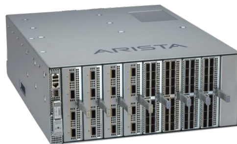
Arista 7368X4: 128 ports of 100G or 32 ports of 400G

Combined with Arista EOS the 7368X4 series deliver advanced features for hyperscale networks, server-less compute, big data farms and machine learning clusters.