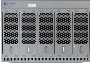
VSP 8608 - Rear View