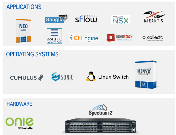
Figure 1. Open Ethernet Operating System and Hardware

With a range of system form factors, and a rich software ecosystem, SN3000 series allows you to pick and choose the right components for your data center.